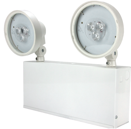
Shown with REN2 LED Lamps