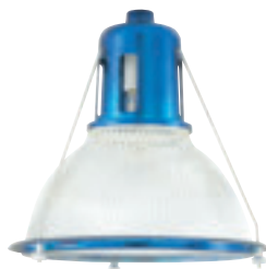
SOR: 10" Glass Reflector Open Housing - Designer Royal Blue finish