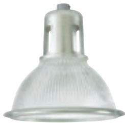
SOL: 10" Glass Reflector Open Housing - Standard Brite Plate finish