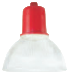
SC: 10" Glass Reflector Closed Housing - Designer Red finish