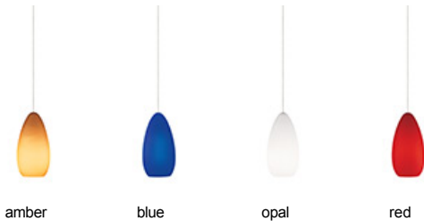
amber blue opal red