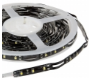
Outdoor LED Strip Lights - Weatherproof 12V LED Tape Light for Curved Surfaces - 32 Lumens/ft.

All specifications are subject to change without notice.