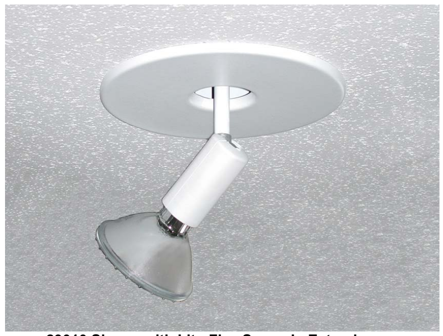
29010 Shown with Lite-Flex Screw-In Extender